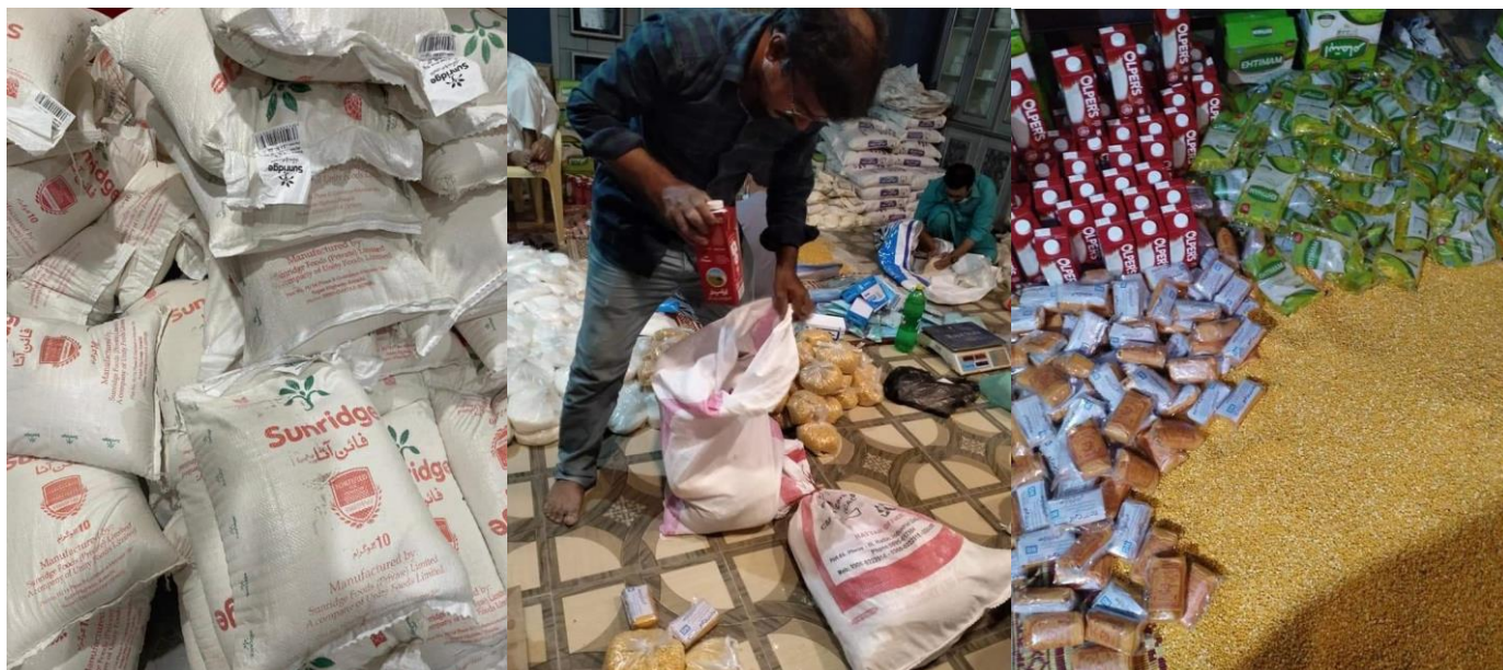
Hyderabad: The Human Rights Youth Organization ration bags are being made by the Hyderabad division to provide rations to deserving families.