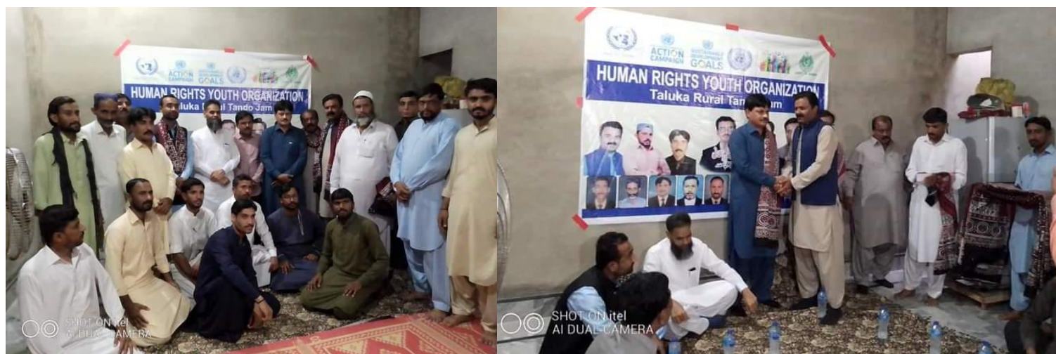
Tando Jam: The Human Rights Youth Organization Officials and team of tando jam are being announced. In this regard, the officials of Hyderabad Division are present in Tando Jam.