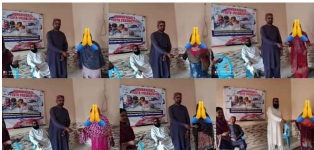
Mirpur Khas: The Human Rights Youth organization distribution checks among deserving women in Mirpur Khas.